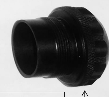
3 Lug Nose Receiver